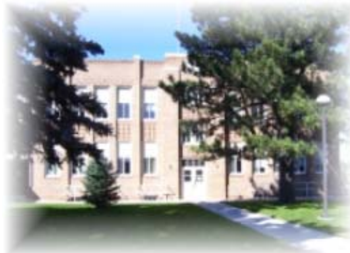
The historic high school building holds a great deal of nostalgia for past generations and tremendous promise for future generations.

One strategy in the economic development plan is to acquire the junior-senior high school buildings (both the original 1942 structure and the 1960 addition) from Laramie County School District No. 2 for use as a cultural and business center.